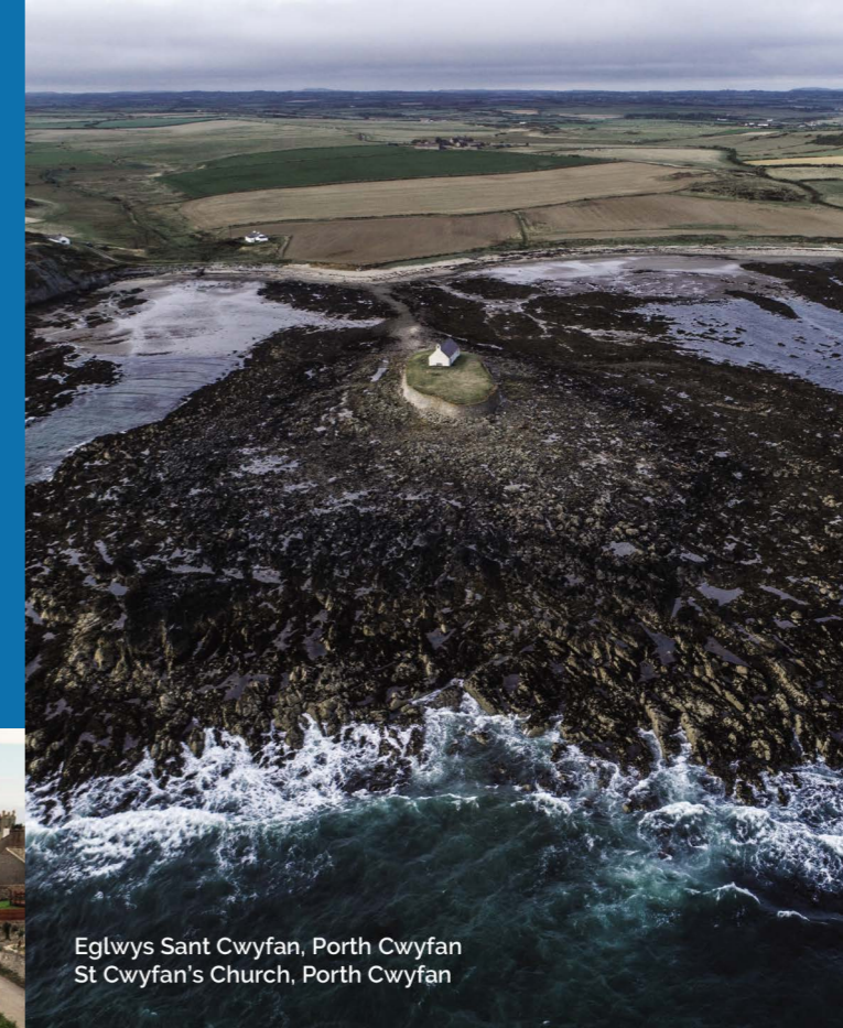
Eglwys Sant Cwyfan, Porth Cwyfan St Cwyfan's Church, Porth Cwyfan