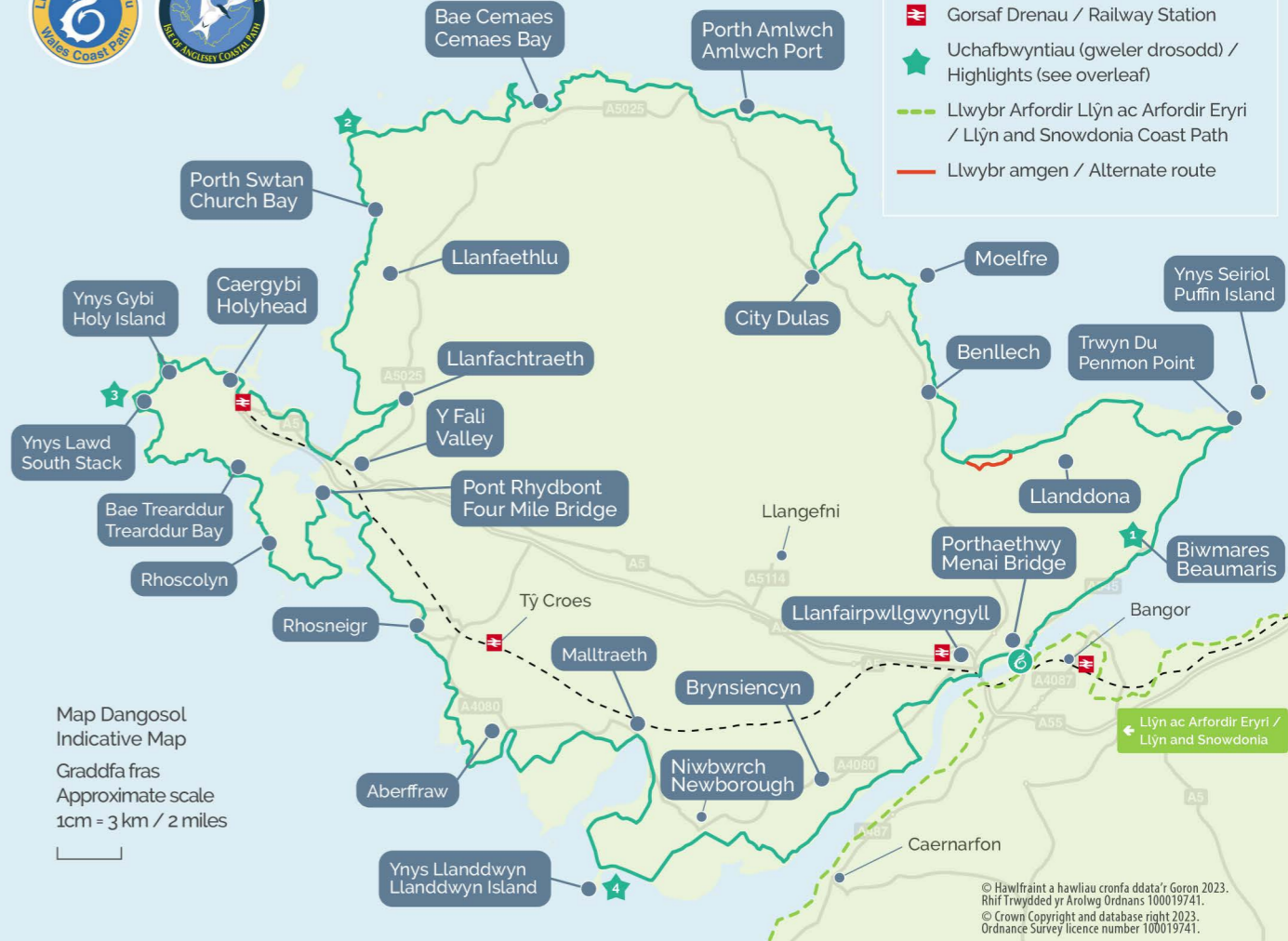
Ynys y Fydlyn